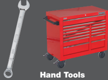
Hand Tools & Storage