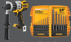
Power Tools & Accessories