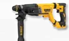
$329 DCH263B 272JP4 20V MAX* 1-1/8" Brushless SDS PLUS D-Handle Rotary Hammer (Tool Only)