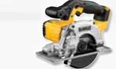
$239 DCS373B 209F74 20V MAX* 5-1/2" Metal Cutting Circular Saw (Tool Only)