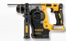
$345 DCH273B 209F87 220V MAX* XR® Brushless 1" SDS PLUS L-Shape Rotary Hammer (Tool Only)