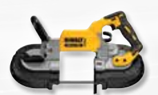
$350 DCS374B 209F89 20V MAX* XR® Brushless Deep Cut Band Saw (Tool Only)