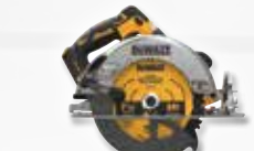
$279 DCS573B 359WF0 20V MAX* 7-1/4" Brushless Circular Saw w/FLEXVOLT Advantage™ (Tool Only)