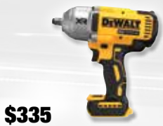
$335 DCF900B 386VL5 20V MAX* XR® 1/2 In. High Torque Impact Wrench w/ Hog Ring Anvil (Tool Only)