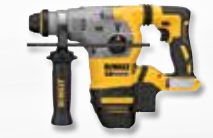
$449 DCH293B 234Z76 20V MAX* XR® Brushless 1-1/8" SDS PLUS L-Shape Rotary Hammer (Tool Only)