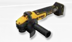
$279 DCG409VSB 390RL3 20V MAX* 4.5" - 5" Variable Speed Grinder w/FLEXVOLT ADVANTAGE™ Technology (Tool Only)