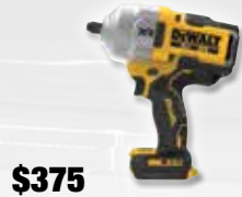
$375 DCF961B 390RL4 20V MAX* XR® Brushless 1/2" High Torque Impact Wrench w/ Hog Ring Anvil (Tool Only)