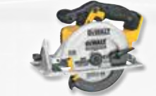
$155 DCS391B 390RL1 20V MAX* 6-1/2" Circular Saw (Tool Only)