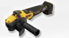
$279 DCG416VSB 390RL2 20V MAX* 4.5" - 5" Variable Speed Grinder w/FLEXVOLT ADVANTAGE™ Technology (Tool Only)