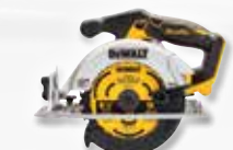
$220 DCS565B 359WF3 20V MAX* XR® 6-1/2" Brushless Circular Saw (Tool Only)