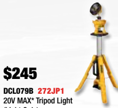
$245 DCL079B 272JP1 20V MAX* Tripod Light (Light Only)