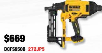
$669 DCFS950B 272JP5 20V MAX* XR® 9G Fencing Stapler (Tool Only)

*Maximum initial battery voltage (measured without workload) is 20 volts. Nominal voltage is 18.