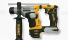
$215 DCH172B 389TW0 ATOMIC™ 20V MAX* 5/8" Brushless SDS Plus Rotary Hammer (Tool Only)