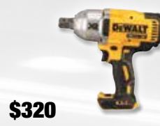
$320 DCF897B 58JL99 20V MAX* XR® High Torque 3/4" Impact Wrench w/ Hog Ring Retention Pin Anvil (Tool Only)