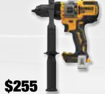
$255 DCD999B 386VL4 20V MAX* 1/2" Brushless Hammer Drill/Driver w/ FLEXVOLT ADVANTAGE™ (Tool Only)