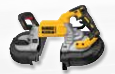
$430 DCS376B 272JN6 20V MAX* 5" Dual Switch Band Saw (Tool Only)