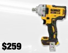
$259 DCF892B 386VL6 20V MAX* XR® 1/2" Mid-Range Impact Wrench w/ Detent Pin Anvil (Tool Only)