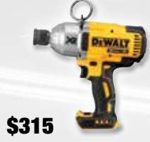
$315 DCF898B 209F48 20V MAX* XR® High Torque 7/16" Impact Wrench w/ Quick Release Chuck (Tool Only)