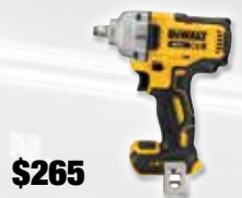
$265 DCF891B 384HX7 20V MAX* XR® 1/2" Mid-Range Impact Wrench w/ Hog Ring Anvil (Tool Only)