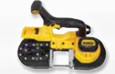
$319 DCS371B 209F45 20V MAX* Band Saw (Tool Only)